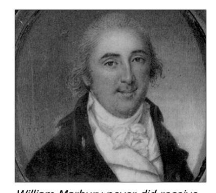
William Marbury never did receive his commission.

The Supreme Court agreed that Marbury had a right to receive his commission, but disagreed that the Court had the power to issue the writ. Why? Because the Supreme Court gets its power directly from the Constitution, and the Constitution says only certain kinds of cases can start at the Supreme Court. That meant the 1789 law passed by Congress was unconstitutional. Congress did not have the power to allow more kinds of cases to start at the Supreme Court. Therefore, the Supreme Court said it could not help Marbury get his commission.